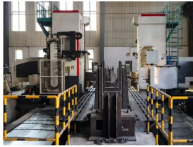
Large double-sided floor boring machine