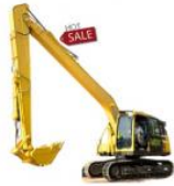
Long Reach Boom