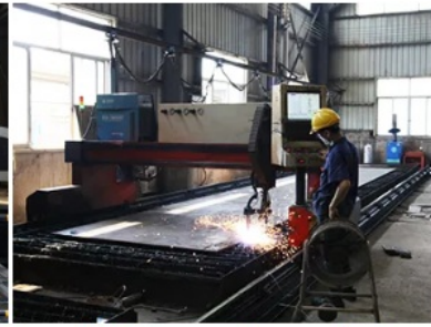
CNC plasma cutting machine