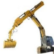
Three-Section Telescopic Arm