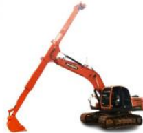
Two-Section Telescopic Arm