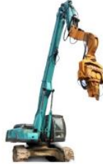
Pile Driving Arm