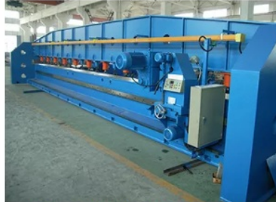
Automatic edge milling machine