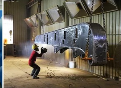
Environmentally friendly spray booth