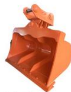
Ditch Cleaning Bucket