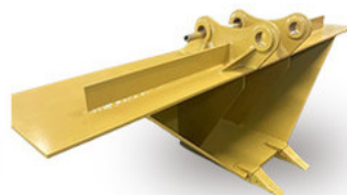
V shape Bucket