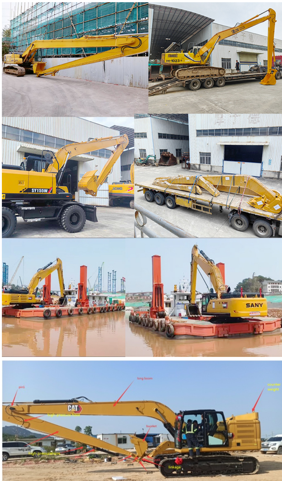
Long Reach Boom Arm Accessories