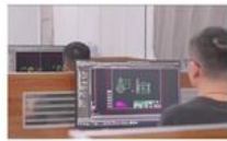
① Drawing Design