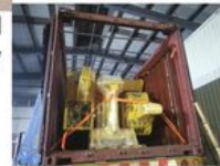
⑭ Packaging and Delivery