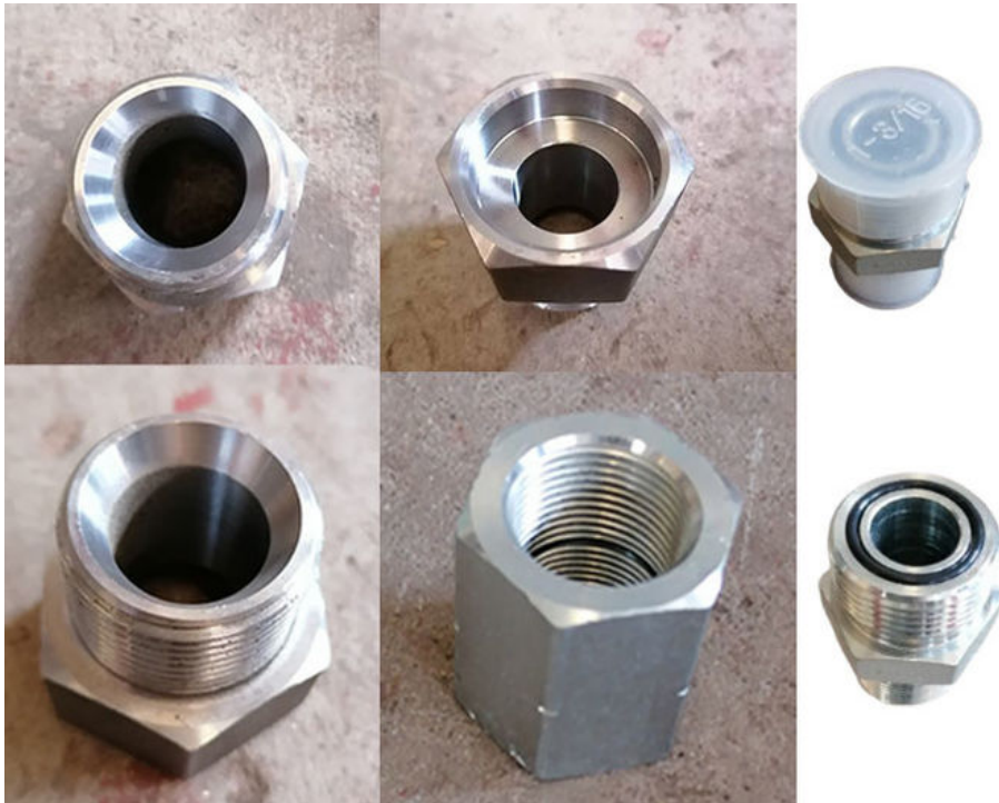
Production details of one set of telescopic boom long reach boom long arm:

* Full Tests during Production: Quality Guaranteed * Standard Production Line: Every staffs have more than 6 years experienced