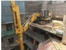
For Deep foundation pit construction project