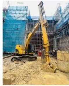
Bridge construction projects