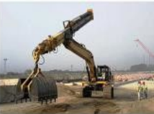
For Large-scale earthworks