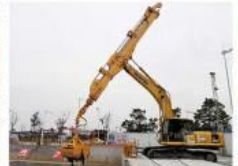
For unloading materials