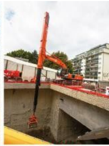
Deep pit work