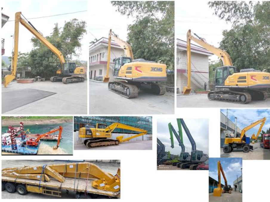
Production Process Details of one set of Long Reach Excavator Reach: