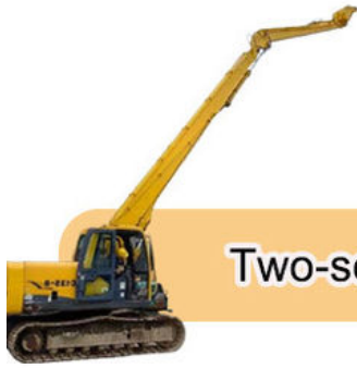
Two-section Demolition Arm