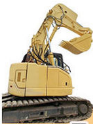
Tunnel Arm / Shorten Arm