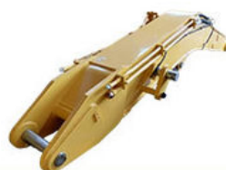
Tunnel Arm / Shorten Arm