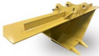
V shape Bucket

Feedback of Excavator Long Excavator Arm from Clients: