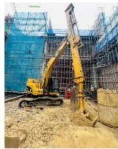
Bridge construction projects