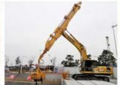
For unloading materials