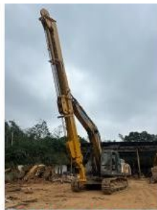
Telescopic arm test