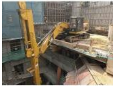
For Deep foundation pit construction project