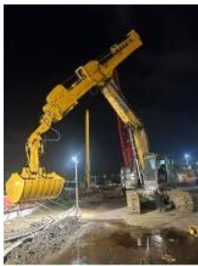
Cleaning and dredging