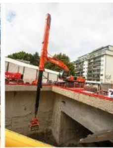
Deep pit work