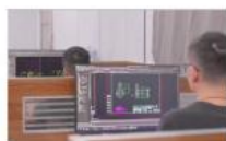
① Drawing Design