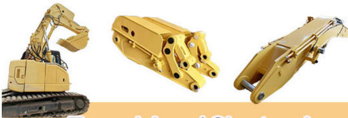
Tunnel Arm / Shorten Arm