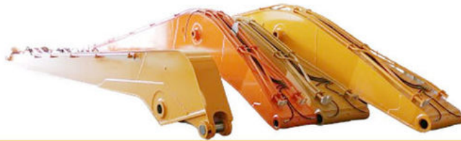
Long Arm Long Boom