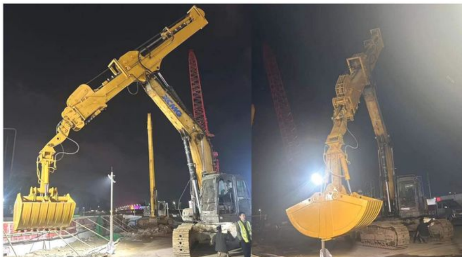
30m for ZX490