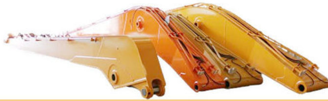
Long Arm Long Boom