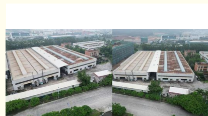
18000M² Steel Structure Workshop with Super Precision Machines