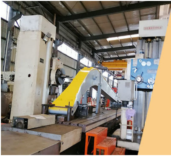
Large floor-standing double-sided boring machine Higher accuracy