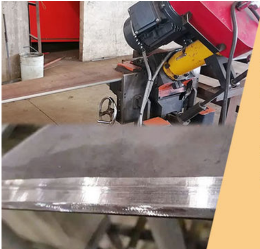
Beveling Machine Every board will be beveled before being welded which enhances the weld bead