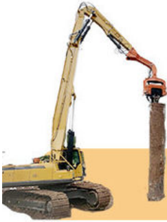
Pile Arm Pile Boom