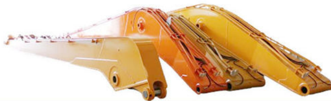
Long Arm Long Boom