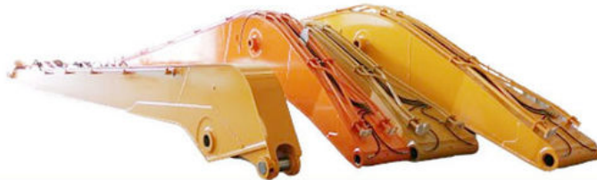
Long Arm Long Boom