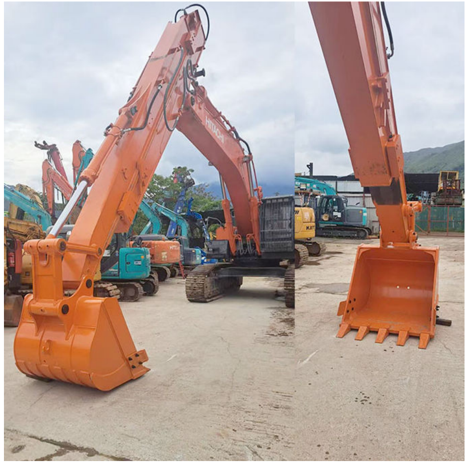
Model drawing of 11M hydraulic telescoping excavator for Hitachi 490:

* Connectors of telescopic arm excavator: High quality connectors which is not easy to oil leakage