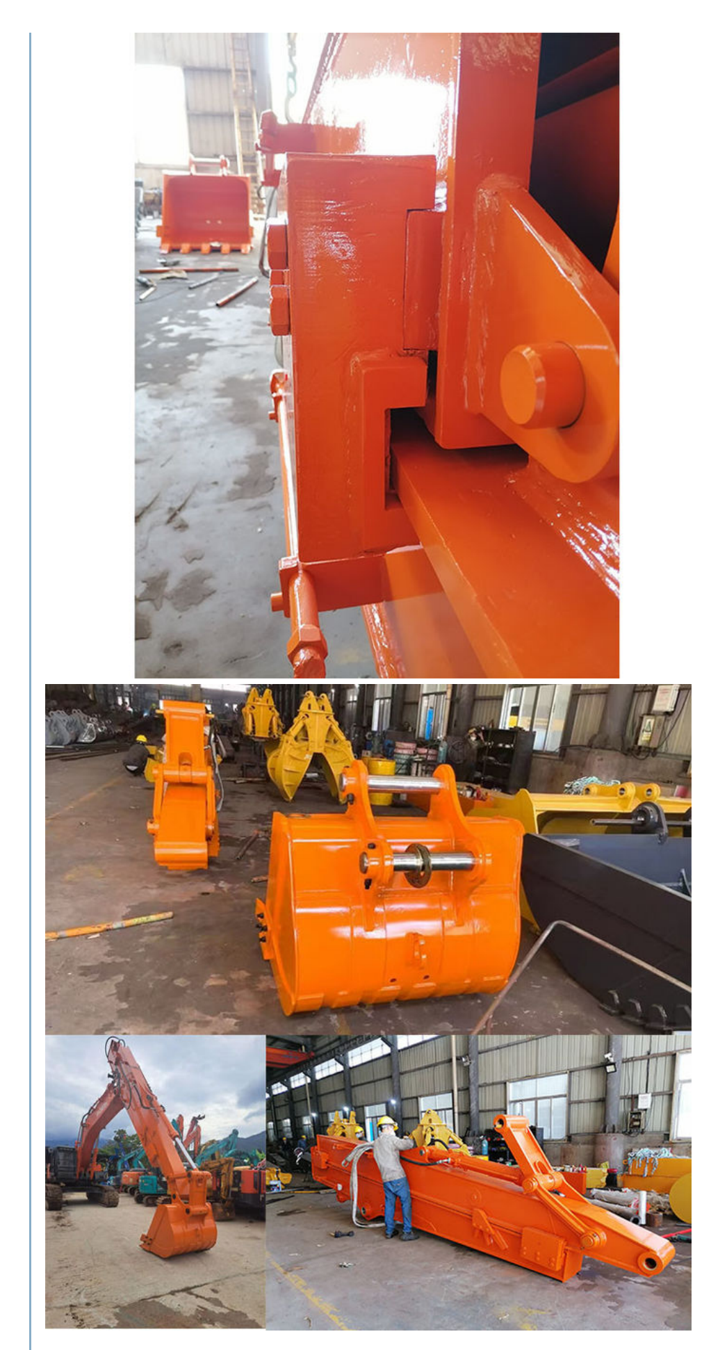
Differences between Kaiping Zhonghe Machinery's Telescopic arm for sale with others: