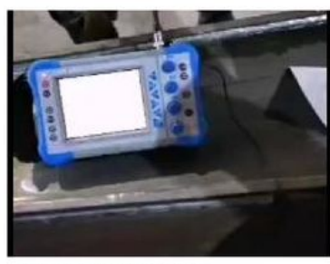
Weld flaw detection Make sure premium welding and not easy cracking 焊道探伤检测--确保优质的焊道和不 容易开裂