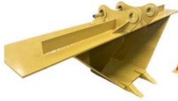
V type bucket