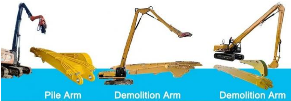
Pile Arm 打桩臂