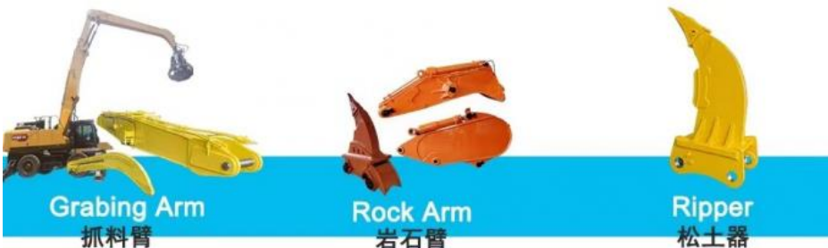
Grabbing Arm 抓料臂