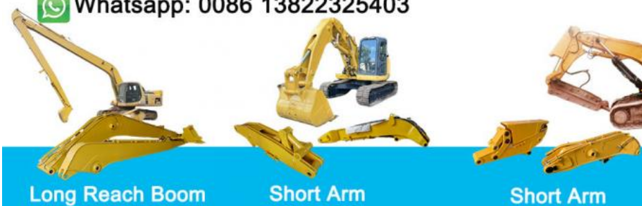
Long Reach Boom