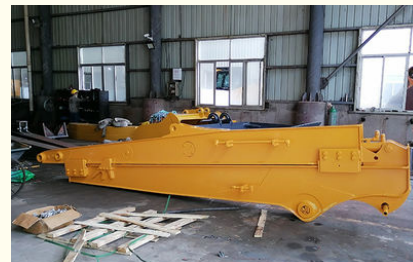
10m sliding arm for Liugong 9250F