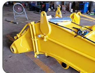
Point 2 Double plate reinforcement in the stress position