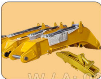
Point 3 Compact design suitable for working conditions