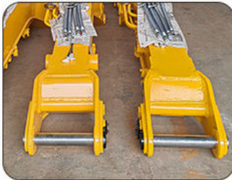
Point 1 Multi-layer welding