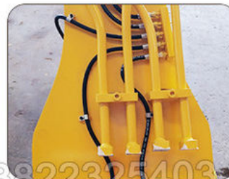
Point 4 Precision steel pipe