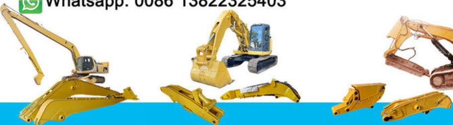
Long Reach Boom