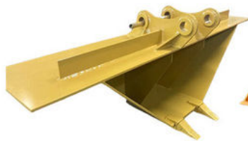
V type bucket