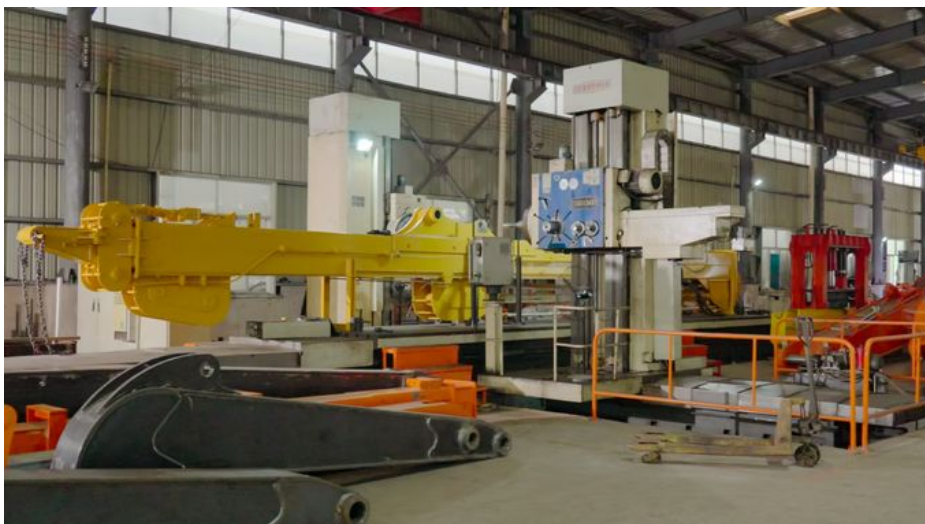
Bauma Exhibition 2024: