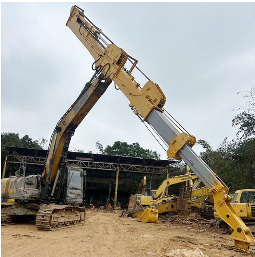
Professional and Experienced production process of excavator clamshell telescopic arm: