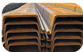
Steel sheet pile