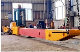
Assembly inspection 安装检测

Full Tests---Every Procedure is under strict supervision 每道工序都是在严格监督下进行