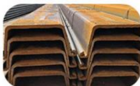
Steel sheet pile