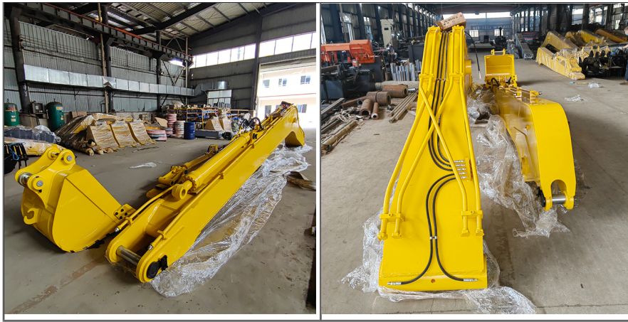
Production details of our long reach excavator reach: