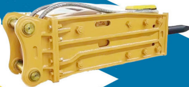
Top type Breaker