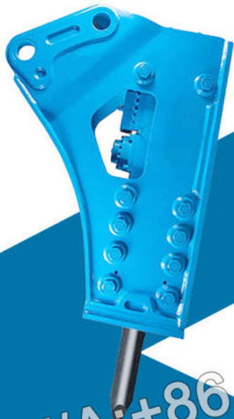
Side type Breaker