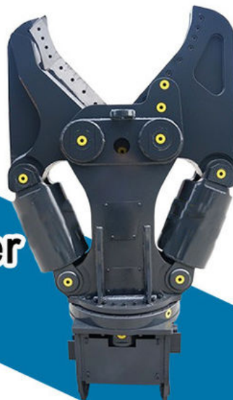
Double Cylinder Shear