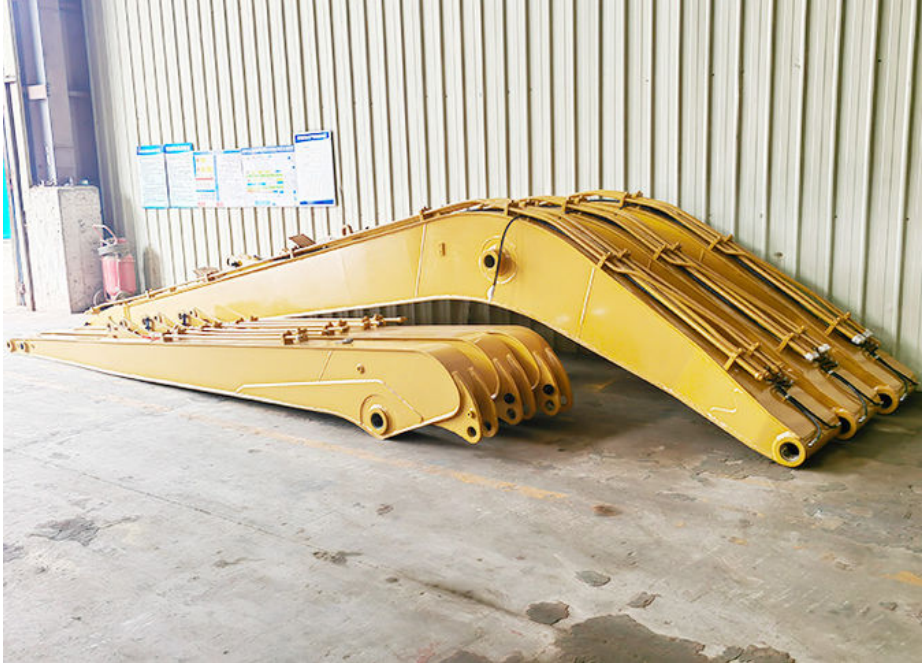
Plates is an essential

Excavator long arm is frequently used in digging sand soid silt etc. Long excavator boom is commonly seen in construction work, like cleaning the river, dredging sand from sea bed, etc. Because the standard arm standard boom can't reach deeply. For specific working condition, excavator long boom arm for sale plays an essential factor.