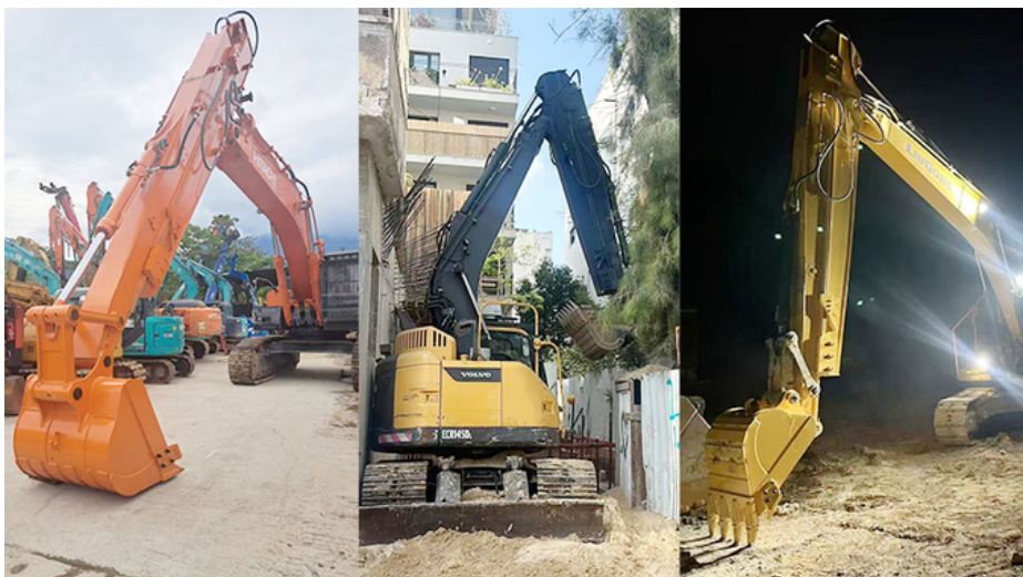
Advantages of one set of excavator telescopic arm: